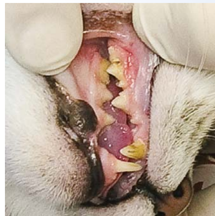
Cat 42 Days After SANOS®

NOTE: Heavy plaque buildup and gingival margin above upper right premolars 106, 107 & 108 prior to application.