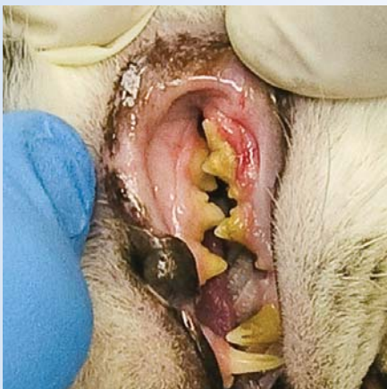
Cat Before SANOS®

NOTE: Heavy plaque buildup and gingival margin above upper right premolars 106, 107 & 108 prior to application.