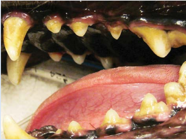
Dog Before Prophy & SANOS®