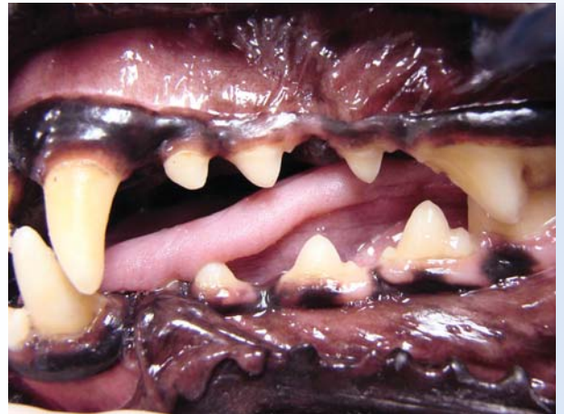
Dog 6 Months After Prophy & SANOS®

NOTE: Be sure to apply a thick film to any observed trouble spots such as the carnassial upper 4 th premolar 208 and upper 3 rd premolar 207. Compare gingival margin at the upper 3 rd premolar 207 in photos: Before Prophy & SANOS® and 6 Months After Prophy & SANOS®.